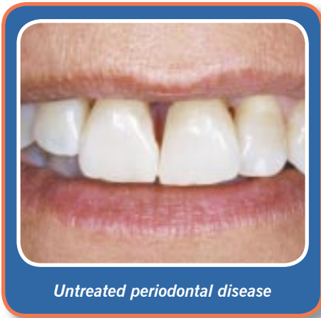
Untreated periodontal disease

► Prevention (a good home care routine and regular dental visits) is your best strategy because gum disease has no symptoms in the earliest stages. It occurs when plaque (bacterial film) builds up. By the time you experience symptoms like discomfort, bleeding, and bad breath, you will already have damaged your gums and possibly even supporting ligaments and bone. Without intervention, you could experience bone and tooth loss.