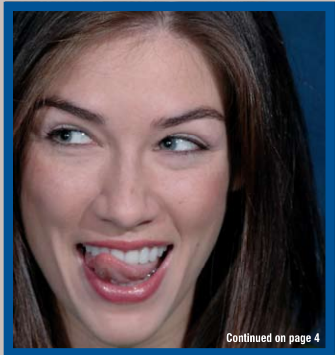
Continued on page 4

"I'd had a veneer placed on that tooth but it didn't match the rest of my mouth - it looked like a big chiclet. Because I was doing theater then, it didn't matter. But now that I'm working on a hit show, with tight close-ups,