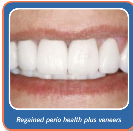
Regained perio health plus veneers

Here are some links that have been demonstrated between oral health and overall health.